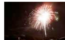
Independence Day Events