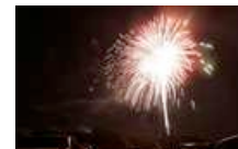
Independence Day Events