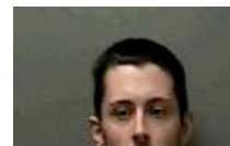
Rutherford County Most Wanted